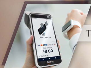
Tap on screen