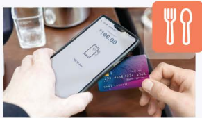
Restaurant & Bar