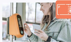
Ticketing and public transport