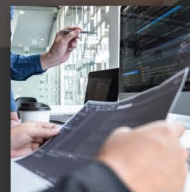
Full support of Level 3 application development and host integration