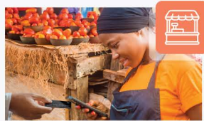
Pop-up store / Weekend market