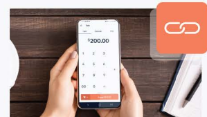
Offline to online