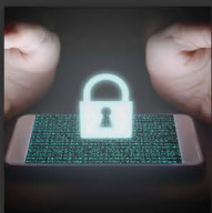
PCI-DSS CPoC Certified Total Solution