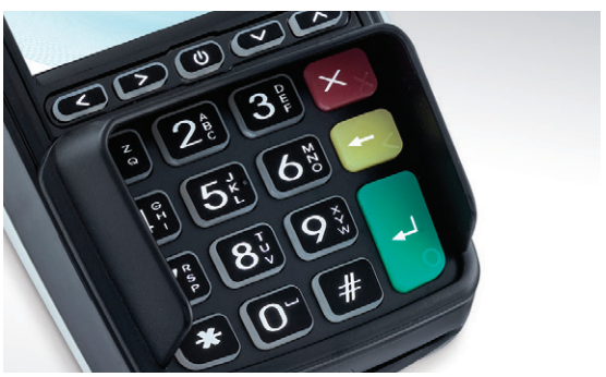
Additional pin entry protection with our designated privacy shield!